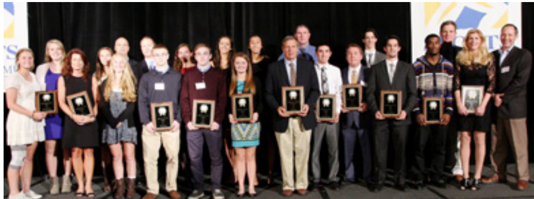
The 16 community Sports Persons of the Year were recognized at SportsNight in October.

Since 2011, the Cohen Academy has traveled to four different county communities (Norwalk, Stamford, Bridgeport and Newtown) to welcome nearly 1,500 summer camp kids from 6 different towns (Bridgeport, Norwalk, Stamford, Greenwich, Stratford and Newtown) and 10 different youth organizations for a day of fun, physical activity and education on nutrition and living a healthy lifestyle.